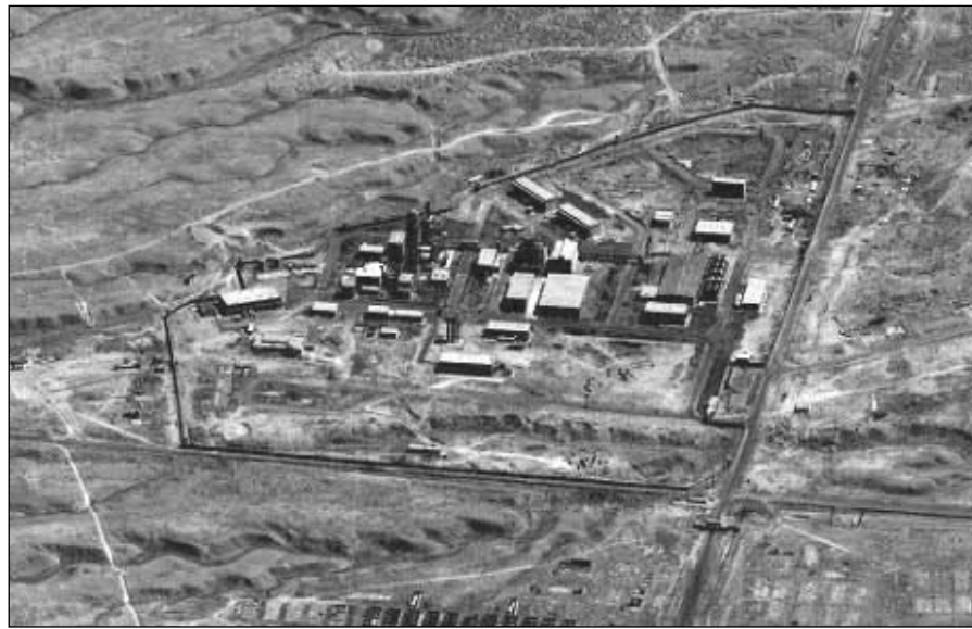
FIGURE 2: AL-SHARQAT CHEMICAL PRODUCTION FACILITY

For example, Iraq has built a large new chemical complex, Project Baiji, in the desert in north west Iraq at al-Sharqat (see figure 2). This site is a former uranium enrichment facility which was damaged during the Gulf War and rendered harmless under supervision of the IAEA. Part of the site has been rebuilt, with work starting in 1992, as a chemical production complex. Despite the site being far away from populated areas it is surrounded by a high wall with watch towers and guarded by armed guards. Intelligence reports indicate that it will produce nitric acid which can be used in explosives, missile fuel and in the purification of uranium.